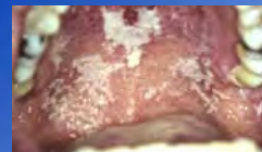
Thrush (oral candidiasis)

A common fungal infection of the mouth seen in connection with HIV infection and it often includes white patches?